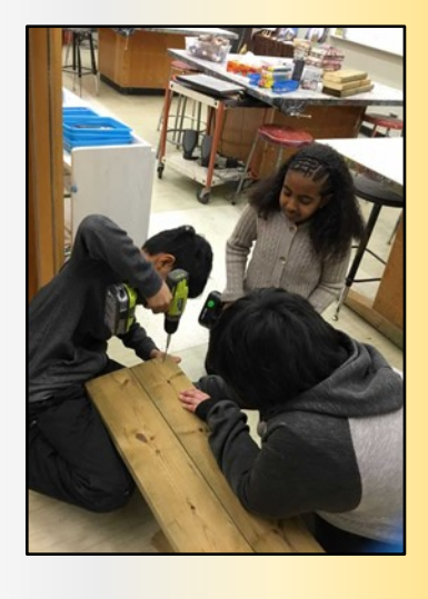
Students helping to build the indoor planter boxes.

The ESD committee has worked hard over the last two years creating spaces for students to interact with nature.