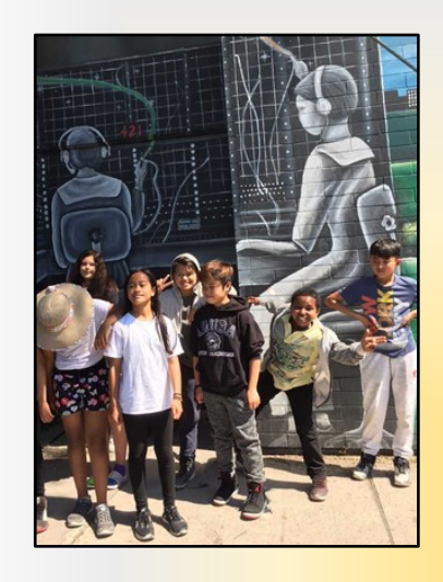
Students exploring community murals looking for ideas for 7 Teachings mural.