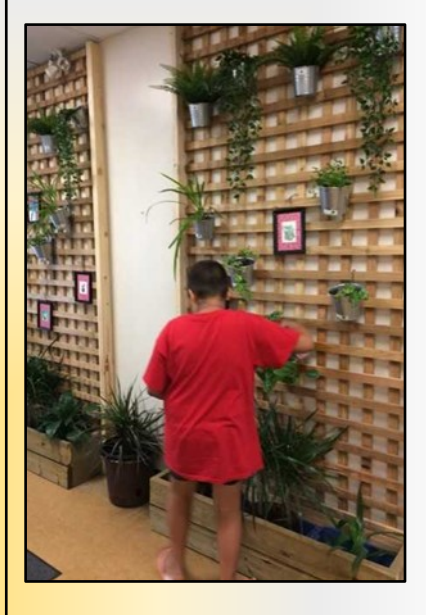
Indoor learning space with a student helping water the living wall.

The ESD is working with students to develop a Seven Teachings mural to be incorporated into the outdoor learning classroom.